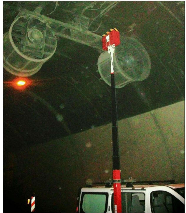
2. Tunnel lining can be quickly inspected with a retracting mast installed on a vehicle.