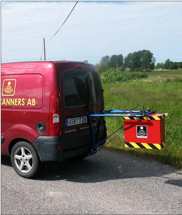
1. The antenna is easily mounted on a vehicle.